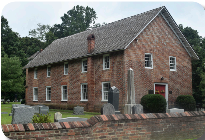
A special tour of Durham Church and the cemetery focused on the descendants of the families of Friendship Farm.