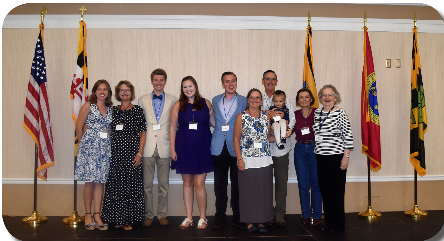
The descendants of the Dent Family of Friendship.