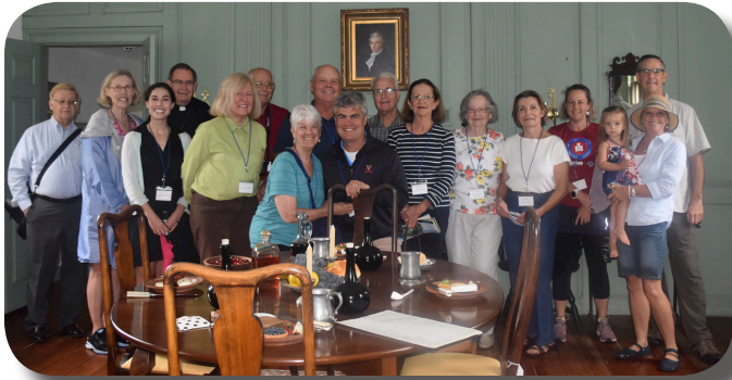
On Saturday, family members toured Historic Port Tobacco Village including Stagg Hall.

T he descendants of the families of Friendship House visited Charles County for a two-day celebration commemorating the 50th anniversary of the rescuing of Friendship House and to honor their ancestors who lived on the Friendship property for more than 200 years. Over 80 descendants of the Guither, Dent, Gray and Karlsson families came from all over the country to participate in this special event in September 2018.