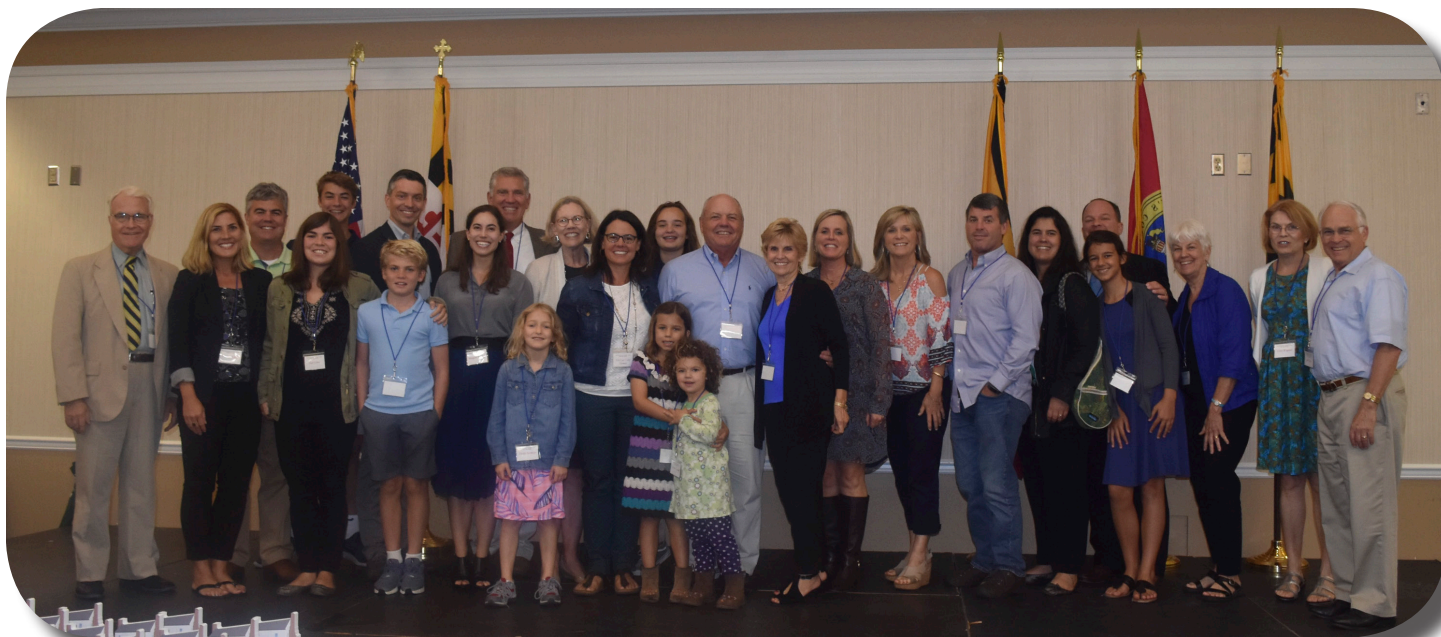
The descendants of the Gray Family of Friendship.