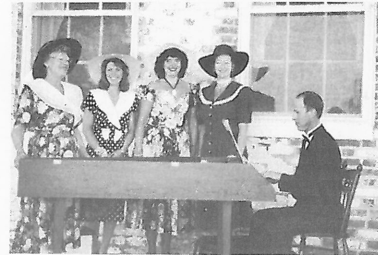
Some of the fashionable crowd enjoying background music from the Harpsichord.