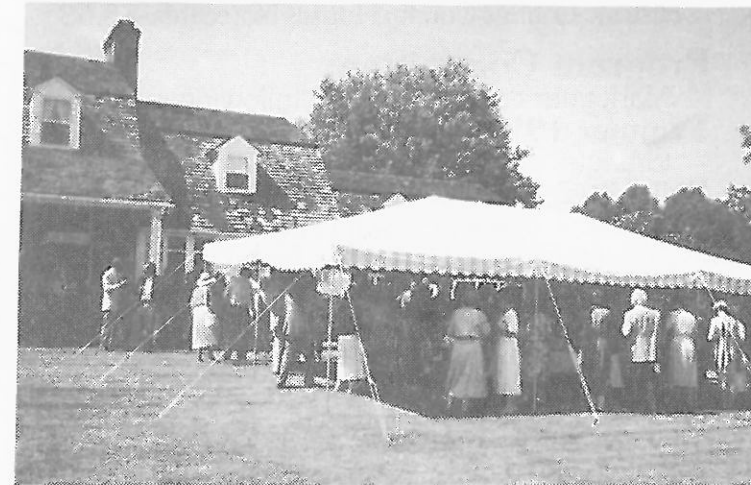
The large tent offered a patch of cool shade under which members and guests sampled a broad menu of tea, tea sandwiches, cakes and punch.