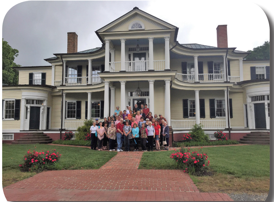
Members of the Historical Society on their field trip to Belle Grove Plantation, May 2017