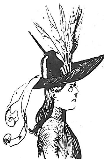
An artist's sketch of Pat Day

This tough job will now be done by Pat Day who can use all the help we can offer—mainly that of paying dues promptly.