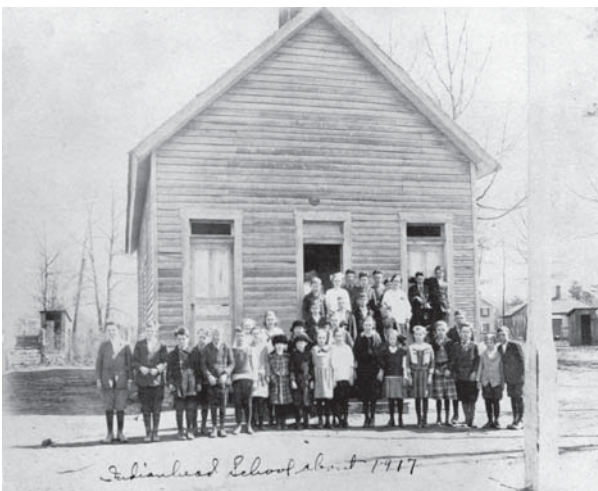
Indian Head One-Room School