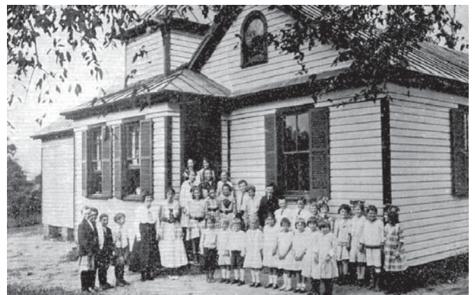
La Plata Two-Room School