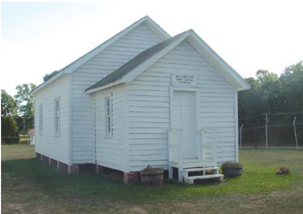
McConchie One-Room School, now located at the Charles County Fairgrounds