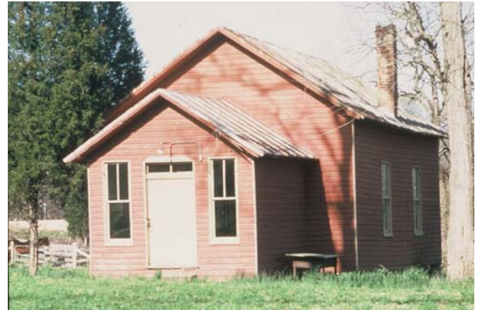
Port Tobacco One-Room School