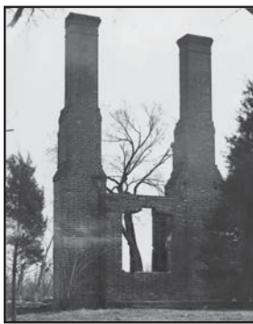
Mulberry Grove, 1938, after fire of 1934