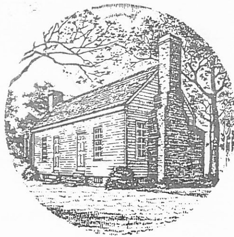
Friendship House, Charles County Maryland